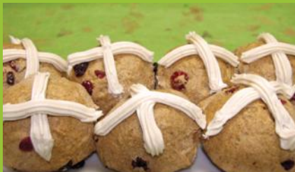
Hot Cross Buns For Easter

BAKING A DIFFERENCE With Freshly-Milled Whole-Grain Flour!