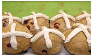
Hot Cross Buns

Orders accepted until 5:00 PM Friday, April 19