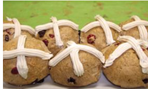
Hot Cross Buns Fridays through Easter