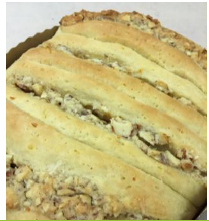
Italian Almond Bread — Fridays