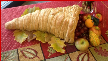
Bread Cornucopias For A Deliciously Festive Table

Baking a Difference With Freshly-Milled Whole-Grain Flour!